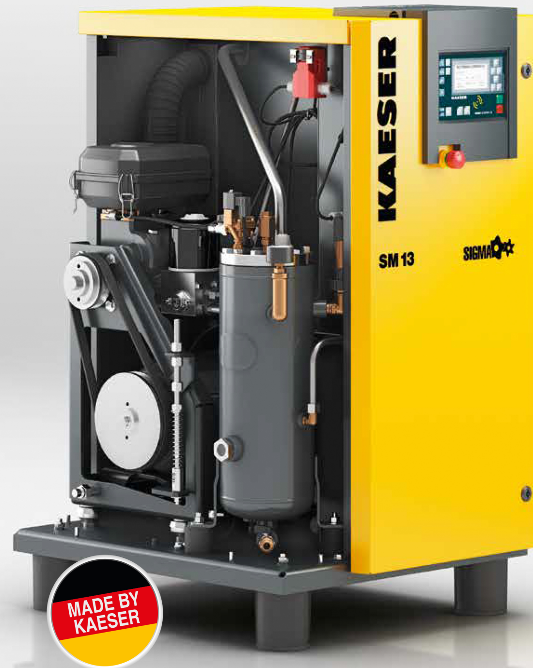
Image: SM 13