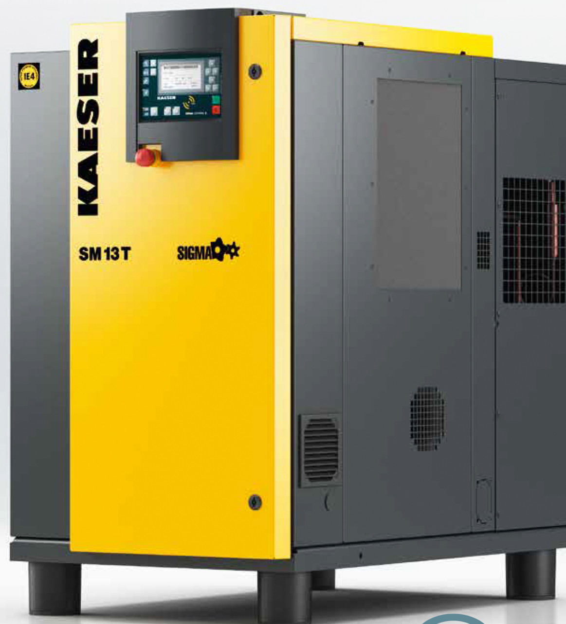
Image: SM 13 T

All maintenance work can be carried out from one side of the unit. The left housing cover is easily removed to allow excellent component accessibility.